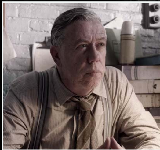
'KELLY' - SEAN GILDER (Starve Achre, Poldark, Hornblower)