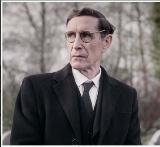
'ARTHUR' - PAUL MCGANN (Withnail & I, Doctor Who, Annika)