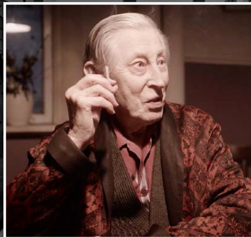
'LENNY' - MURRAY MELVIN (A Taste of Honey, Barry Lyndon, The Devils)