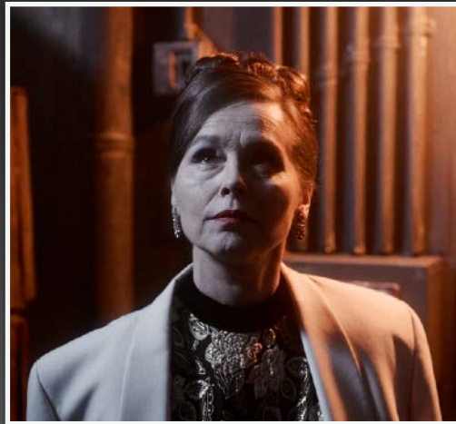
'VIC' - TARA FITZGERALD (Brassed Off, Sirens, Game of Thrones)